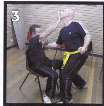
...and draws the attacker down into a palm-strike while simultaneously trapping his wrist.