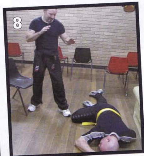
...and remains on guard as he assesses whether any threat remains.