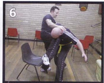
...then scoops behind the attacker's neck and pulls him into a knee strike.